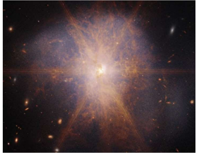
NASA's James Webb Space Telescope captured this image of the merging galaxies known as Arp 220. The object lies about 250 million light-years from Earth.