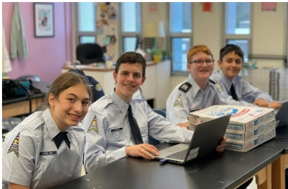
Arlington Career Center Space Force JROTC during practice Round 2 on Nov. 17, 2022. Pizza is always a must for competition rounds!

StellarXplorers IX teams are reaching new heights! The scores from Practice Round 2 were some of the highest scores in program history, and performance in Qualification Round 1 did not disappoint.